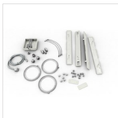
862932210 SL629 Starter kit/ending kit RAL9016 White RAL9016