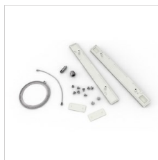
862932310 SL629 Connection kit RAL9016 White RAL9016